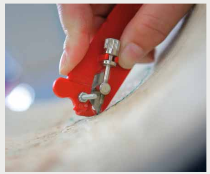
Figure 2: Cut made into inner film, with limitation of cut depth