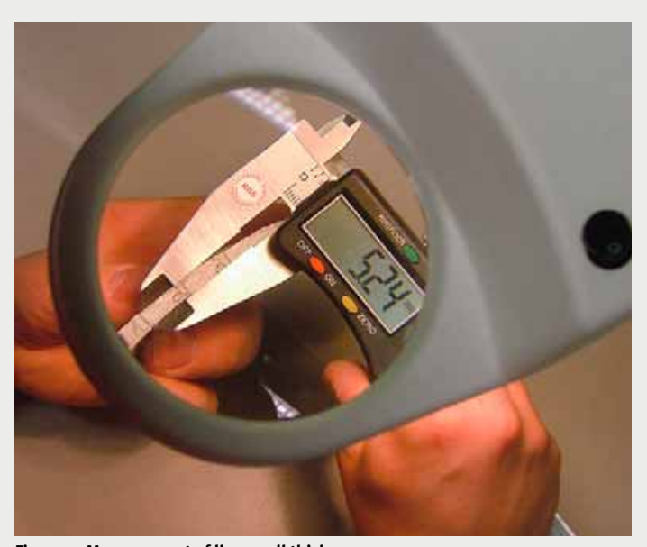
Figure 3: Measurement of liner-wall thickness