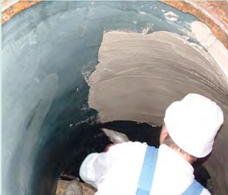
Green-black colouring of the pre-coating inside a manhole with strong impact of sulphuric acid

In many cases inadequate materials, especially for pre-coating, are used. For example, for concrete manholes with severe corrosion only grout products are suitable, which were developed especially for the use in very aggressive sewage.