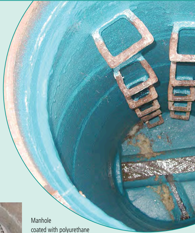
Manhole coated with polyurethane