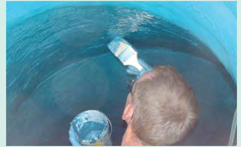
finishing treatment of a polyurethane coating