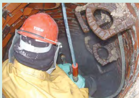
Investigation of alternative pre-treatment techniques