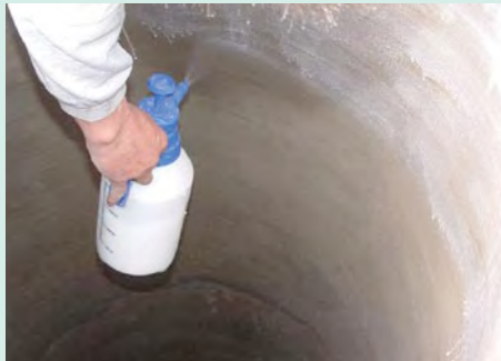
A finishing treatment medium can be of great help

In addition, if, while applying the coating, the single, already dried layers are not roughened before applying a new layer, a bad result of the renovation can be the consequence. Principally, the grout coating is to be protected from direct insolation especially in the cone area. By applying a finishing treatment medium to