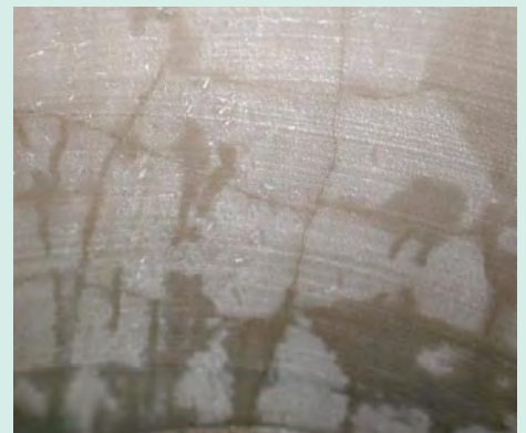
Cracks often become obvious after a couple of months

Weaknesses in the polyurethane coatings normally showed directly after applying the coating or at the latest after an ascent of the groundwater level. In many grout coatings numerous deficiencies could only be observed during an inspection several months after the coating measure. This might be due to the fact that the tensions in grout coatings, which are responsible for the formation of cracks or debonding of the coating, only develop after a few days or weeks from a mathematical point of view.