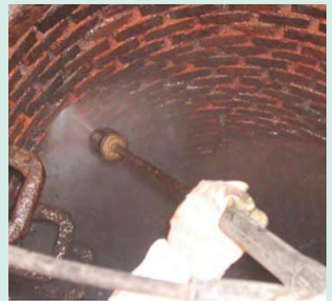
High-pressure water cleaning of a manhole wall with a hand lance

Inaccurate application of the coating, in particular, could be identified as a main reason for the poor renovation quality. Furthermore, the preparation of the subsurface was insufficient in many cases. Generally, the preliminary cleaning of the manhole with water pressure, which is very common today, only seems to be suitable to a limited extent for preparing the coating measure. It can be recorded that the current measures for quality assurance – especially when looking at the usual practice – urgently need improvement. This is why IKT – starting from the experiences made – develops help guidelines for quality assurance, which can be used by the sewage network operators for tendering, construction monitoring and final acceptance of renovation measures using coating methods.