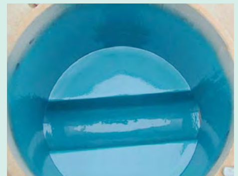
Flawless polyurethane coating also with a high surface moisture level

The laboratory experiments clearly show big differences between the single products offered on the market. Especially the sensitivity towards moisture differs: while one of the PU-products analysed reacted to a high level of moisture, another PU-product showed no visually noticeable reactions.