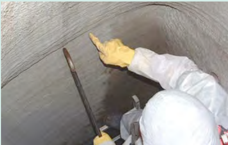
A detailed visual inspection is great help when assessing the quality of a coating

A detailed visual inspection under high groundwater levels including tapping the coating is particularly suitable for an acceptance of manhole coating measures. Lacks in quality such as cracks and leaks can usually be noticed rather well: due to the typical sound when tapping the coating also hollow spots behind the coating can be registered.