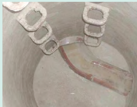
Completely pre-coated brick-built manhole

Brick-built manholes with strong joint corrosion and concrete manholes with advanced concrete corrosion have a very uneven wall surface. Before these manholes can be coated by spray lining, the surface needs to be flattened manually with a pre-coating of mineral mortar first.