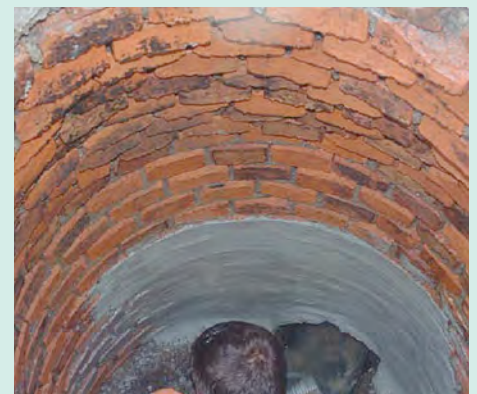
Applying the grout onto a „dirty“ wall

In practice, insufficient preparatory cleaning can occur. This is why after completed cleaning dirt residues can be found on parts of the wall. A finishing check of the manhole wall before applying the coating is not carried out in all cases.