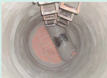
Manhole coated with mortar