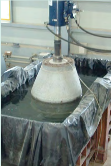
Dynamic load of a coated manhole

To complement these on-site measures, experiments were carried out in the IKT-laboratories and test facilities. In this way, for instance, the effects of intensive traffic loads on a coated manhole could be simulated or the bonding behaviour of coatings on water-saturated concrete surfaces could be investigated further.