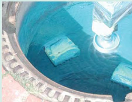
Polyurethane coating in the gunite lining process