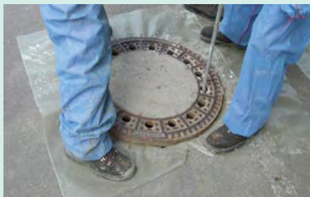
Sealing the manhole cover simply does not suffice

the mortar coating directly after the renovation works, it seems to be possible to prevent too quick drying of the mortar. Sealing the manhole cover with an awning to prevent incoming air does not seem to cause great advantages as a single measure. For polyurethane coatings comprehensive finishing treatment does not seem to be necessary. Here it is advisable, however, to inspect the entire coating cover visually in detail after applying the coating. So imperfections in the coating can be registered and can be removed immediately.