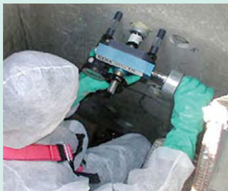
Mortar: adhesion tensile test of a coating

As a criterion of acceptance, in general, the current minimum demands on adhesive tensile strengths of the coatings, influenced by the requirements of structural engineering and bridge