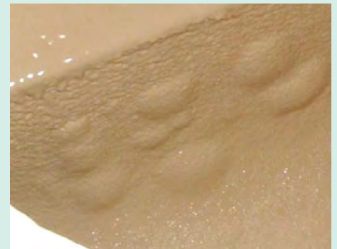
Bubbles in a polyurethane coating with high surface moisture

The laboratory experiments clearly show big differences between the single products offered on the market. Especially the sensitivity towards moisture differs: while one of the PU-products analysed reacted to a high level of moisture, another PU-product showed no visually noticeable reactions.