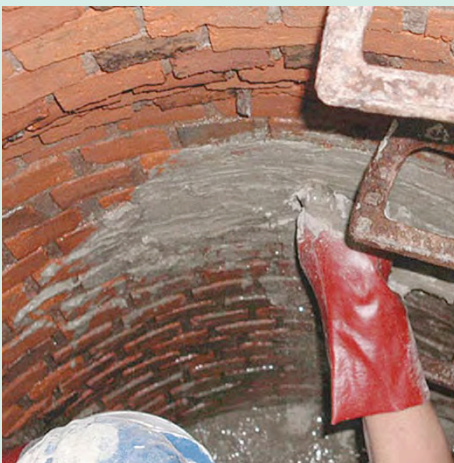
Sealing of a brick-built manhole with filling jointing grout

In brick-built manholes and manholes of pre-fabricated concrete components with corrosion usually a comprehensive mechanical preparation of the surface is necessary. In manholes consisting of prefabricated concrete components without corrosion preparatory works are normally limited to annular joints.