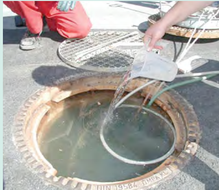
A leaktightness test of a manhole does often not suffice to assess the quality of a coating measure

A water tightness test inside the manhole does not always give reliable statements with regards to the success of a coating measure.