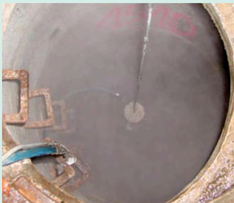
High-pressure water cleaning of a manhole wall with a rotating cleaning nozzle

To keep a sustainable subsurface and the pre-conditions for a good bond of the coating, first of all dirt, coverings and glaze as well as damaged material have to be removed from the manhole wall. For this purpose, usually high-pressure water cleaning is used.