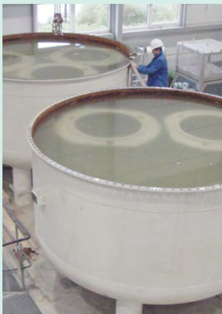
Water saturation of manhole elements