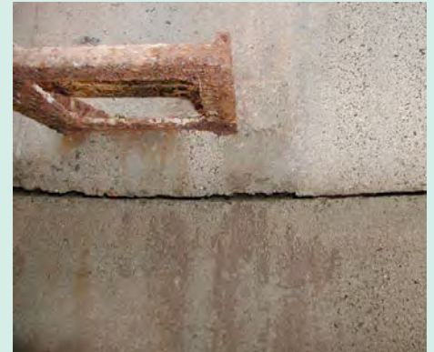
Dirt residues on the wall after cleaning

❗ Control the tidiness of the manhole wall.