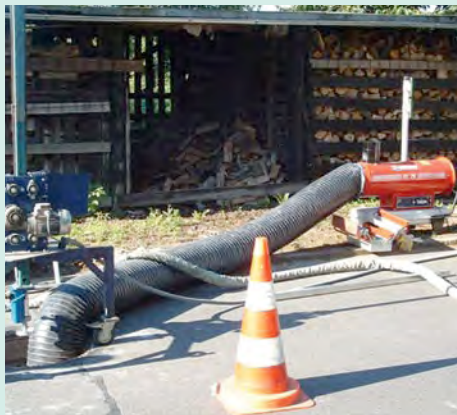
Drying of a manhole in the run-up to a polyurethane coating

All polyurethane products analysed did not adhere well on moist surfaces. Especially on PU-coatings which were applied to soaked brickwork, the IKT testers measured only a slight bond with the surface. In exceptional cases also debonding was observed.