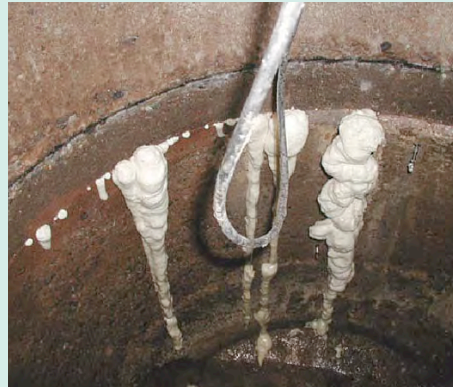
Injection material entering through leaks inside an annular joint of a concrete manhole

Before coating, in many cases the manhole wall needs to be sealed. In manholes of pre-fabricated concrete components good results can be achieved with injections like polyurethane resins, for example. Sealing by means of injection in brick-built manholes is more laborious. If there is no in-situ groundwater that pushes, here especially quickly setting repair grout is helpful.