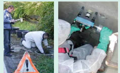
Figure left: Documentation of the conditions on the construction site and the renovation Figure right: Quality check of the renovations carried out

42 coating measures in the drainage networks of altogether twelve network operators were monitored. Extensive quality test were carried out over a period of several months. Grout coatings and coatings of polyurethane were used by considering all cleaning- and application methods that are relevant for the market. All renovations were carried out by specialty firms that had only received instructions regarding the coating material and application method. Comments on the renovation procedure were deliberately not made in order to be able to identify the routine working processes, the actual quality of the renovation as well as possible sources of errors and improvement potentials under realistic circumstances.