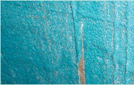
Areas with bad bonding can be noticed after an ascend of groundwater at the latest

A detailed visual inspection is an adequate measure here