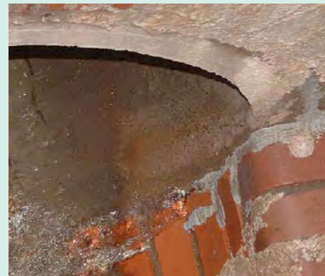
Leakage in the channel in the area of the discharge

Nearly all manholes showed severe damage in the lower area of the manhole body, in many cases the berms, channels and connections to the outgoing sewers also needed renovation.