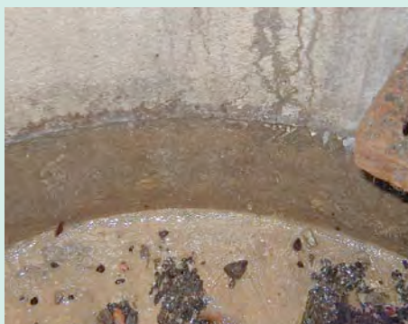
Leaking annular joint inside a manhole of concrete components

In the phase of preparing the renovation the manhole to be renovated should be visually inspected in detail. Ideally, the inspection should be carried out with a high level of groundwater in order to be able to notice leakage in the manhole body.