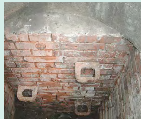
Transition area of a rectangular brick-built manhole/round concrete cone with horizontal ledges in the manhole wall.

Nearly all manholes showed severe damage in the lower area of the manhole body, in many cases the berms, channels and connections to the outgoing sewers also needed renovation.