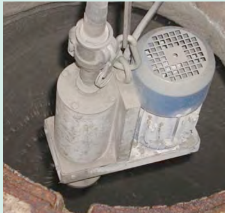
Grout coating in the spray lining process

During the two years of the project the following working program was completed: