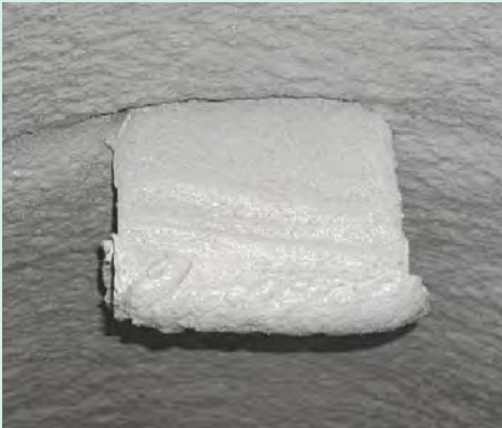
Formation of spray shadows next to a step iron caused by grout coating with spray lining

Damaged branches inside the manhole wall are to be renovated before starting the coating. Step irons should be demounted before coating. After the coating is completed, the use of a ladder is particularly recommended as then the body of the coating has only to be broken through at a few spots.