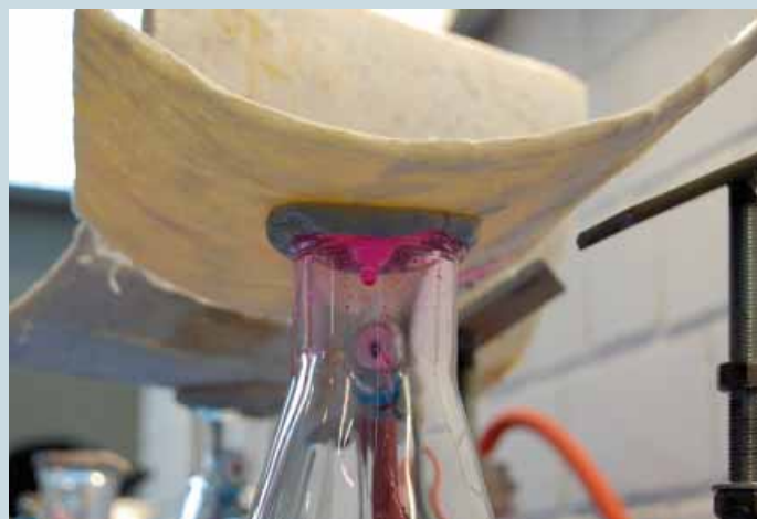
Tightness testing: liner not tight