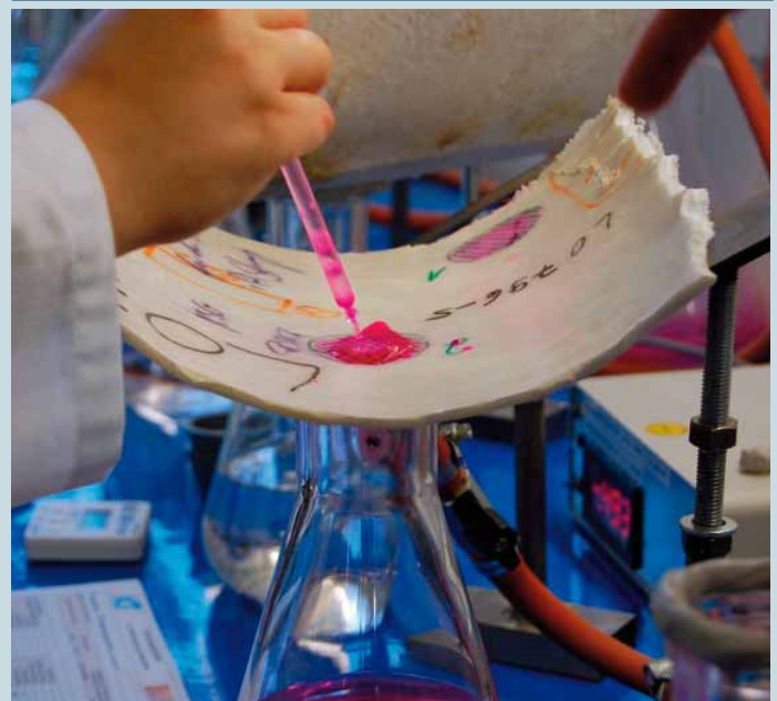
Tightness testing: water containing a red dye is applied to the inner side of the liner