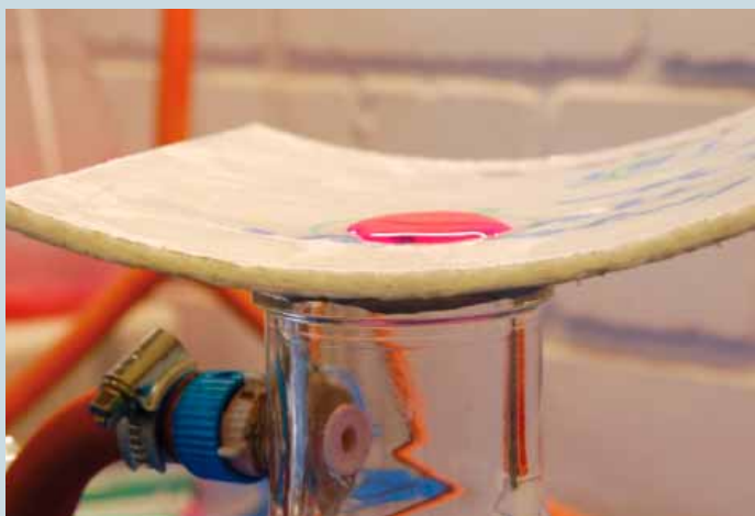
Tightness testing: liner tight