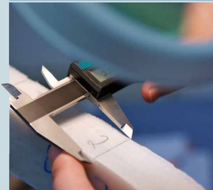
Liner wall-thickness is measured using a precision slide caliper gauge