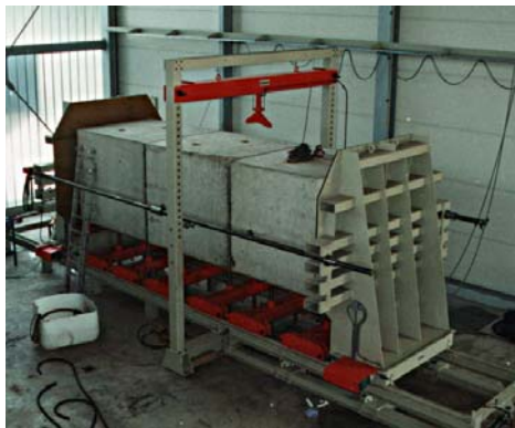
Fig. 2 The testing of water tightness

As a result of these investigations a new pipe connection has been developed with the following main constructional features: