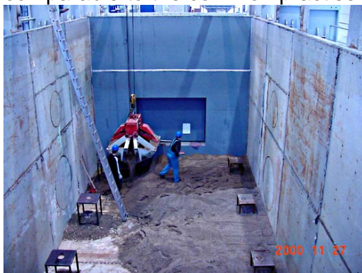
Fig. 3: Fitting of the soil for pipe jacking under laboratory conditions

At present the new prototype is tested under laboratory conditions that are comparable to the common practise of pipe jacking (Fig.3).